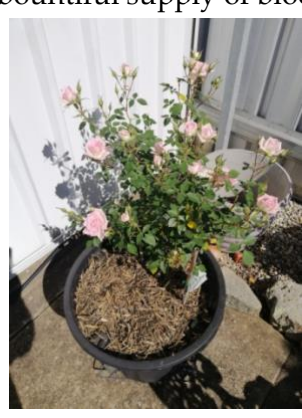
Grown by Shirley Layton. Photo taken 31st August 2020

Figurine is certainly producing a bountiful supply of blooms.